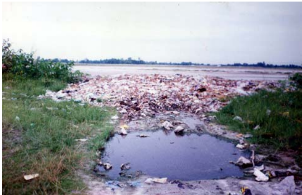
Ratuwa Khola Dumping Site