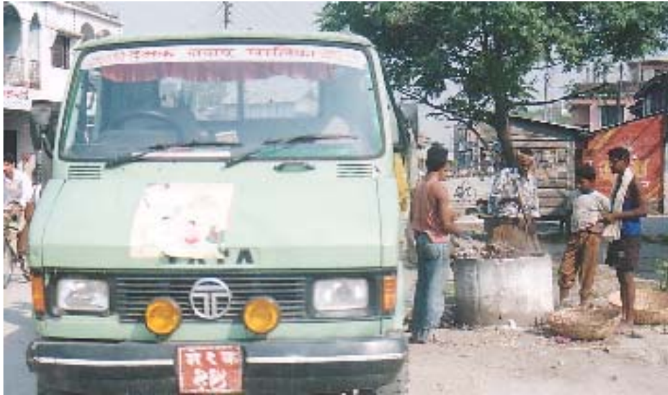
Waste Collection Using a Truck