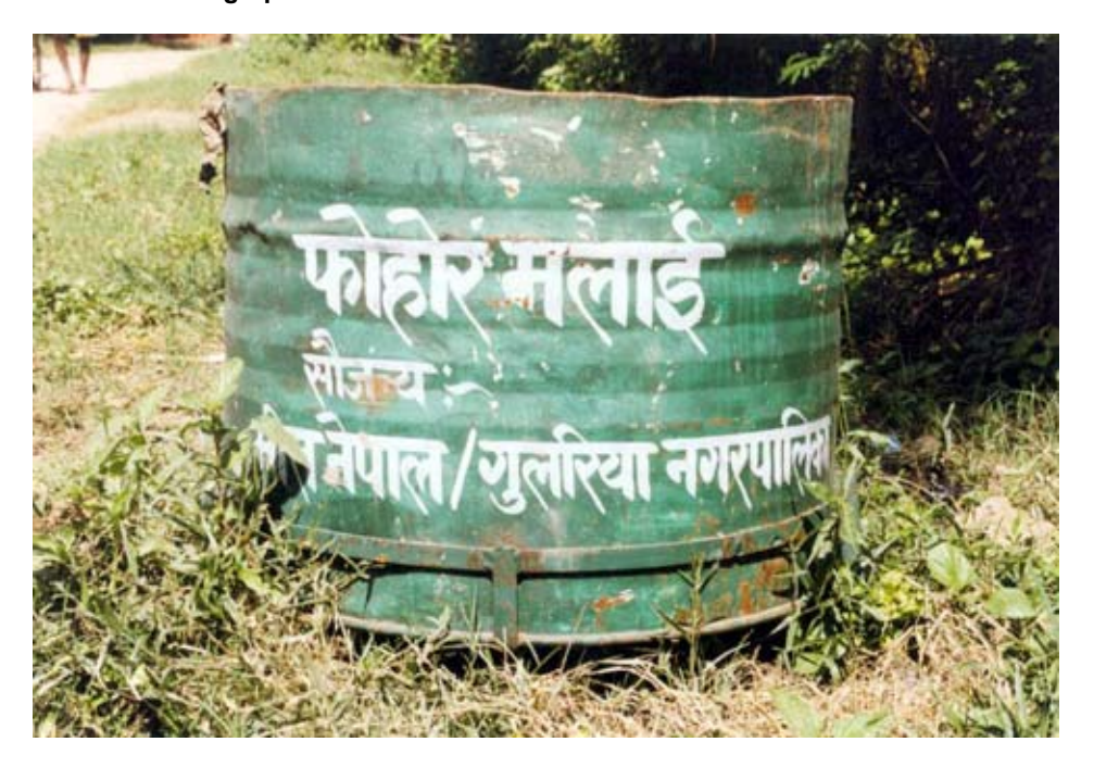
Waste Collection Bin Made from Old Drum