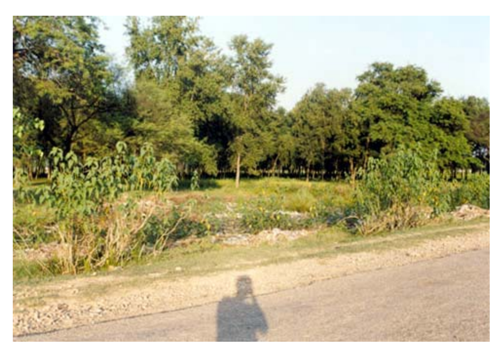
Disposal of Waste along the Highway