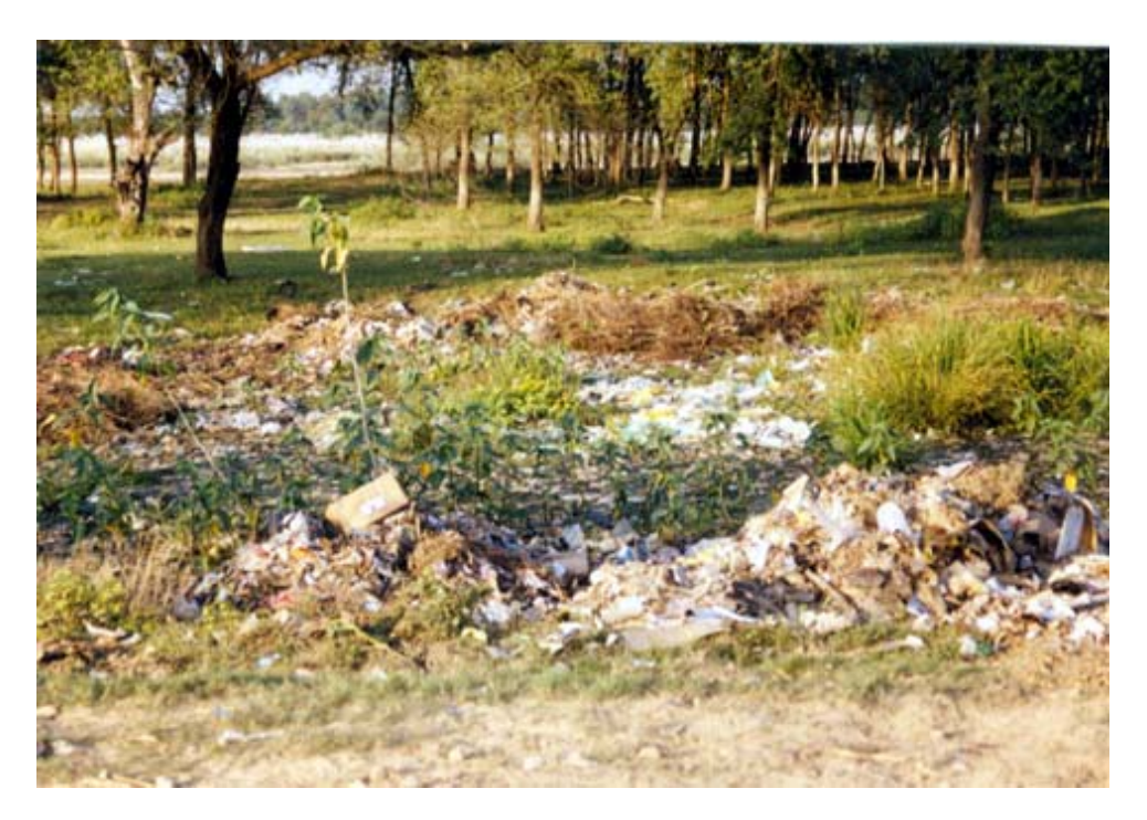
Waste Dumping Site