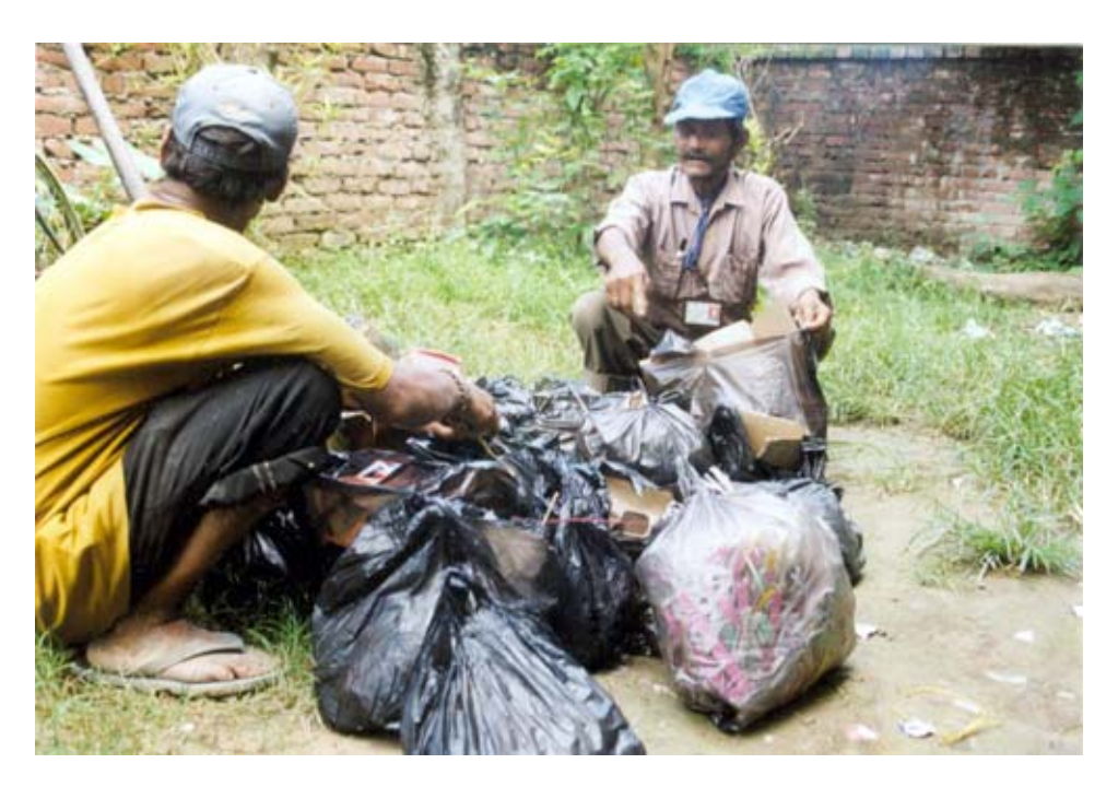
Collection of Waste for Analysis