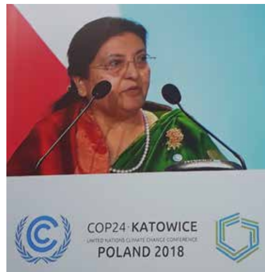
President delivering her speech in COP24