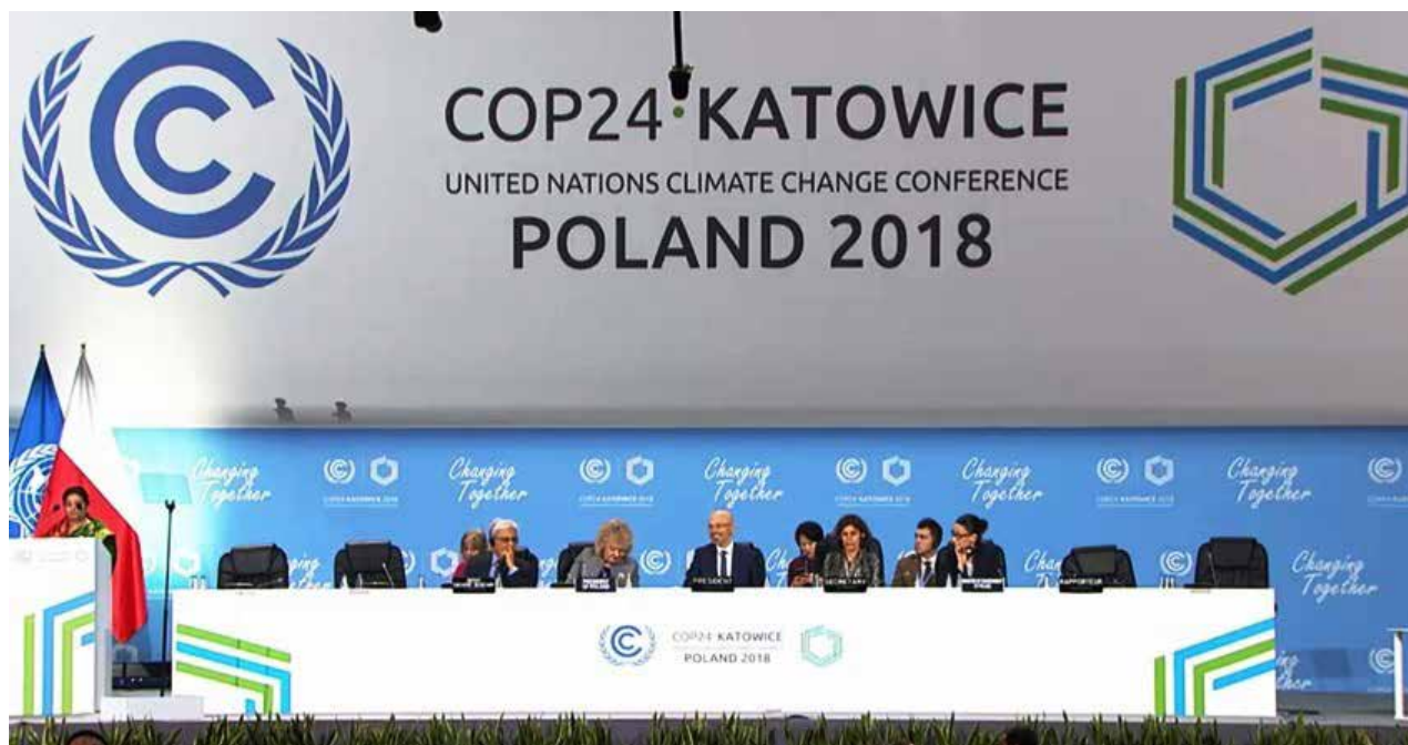
President Bidhya Devi Bhandari addressing the COP24

The conference was highly prioritized by Nepal as the Nepali delegates attended the Conference under the leadership of Honorable President of Nepal Bidhya Devi Bhandari. Nepali delegates comprise Honorable Minister Shakti Bahadur Basnet, Ministry of Forest and Environment together with senior government officials and officials from line ministry, civil society, and media representatives. Government of Nepal conducts several consultations with multi-stakeholders including government agencies, civil societies, media groups for identification and finalization of Nepal’s agenda for the 24 th session of COP to the UNFCCC. Ministry of Forest and Environment prepared the Country Status Paper for COP24-Katowice. Nepal actively engaged in the negotiation process based on the Status Paper.