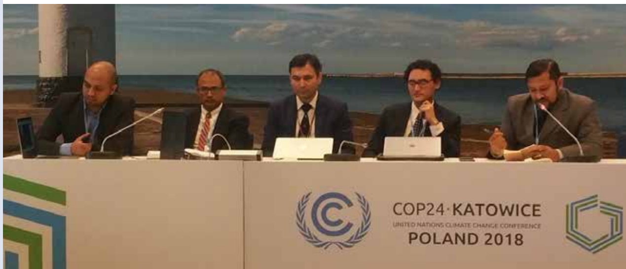
Nepali delegates sharing the updates from Poland