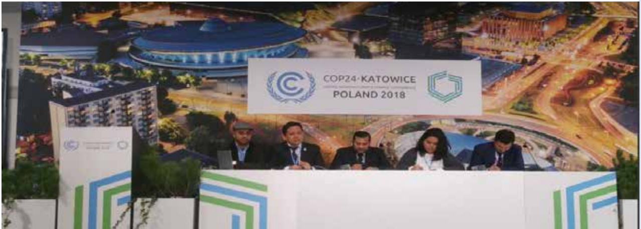
Speaker of the press conference