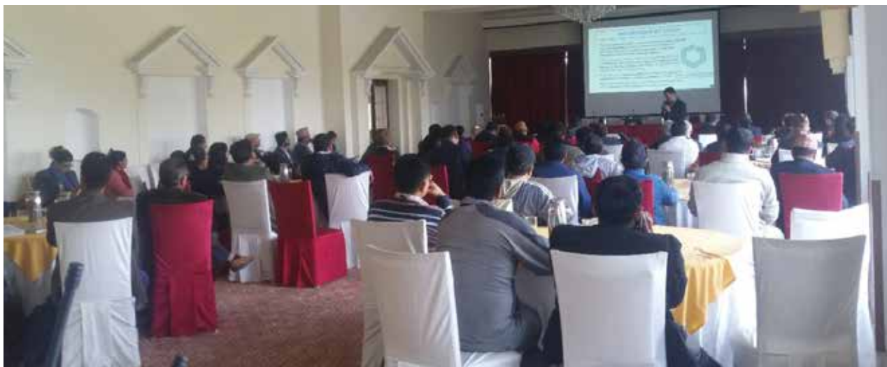
Presentation during UNFCCC COP 24 consultation program