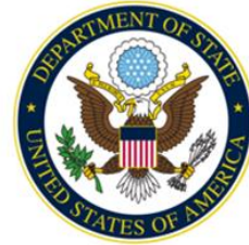
States Department of US